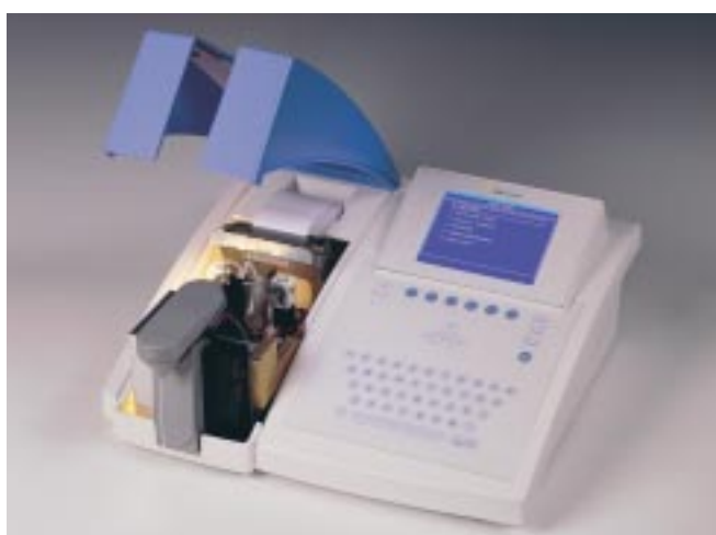
MICROLAB 300 WITH OPEN SERVICE COVER