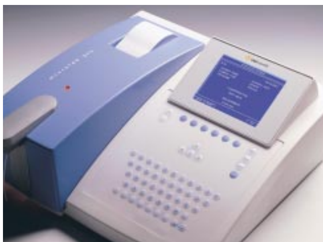
FULL SIZE SCREEN AND QWERTY KEYBOARD